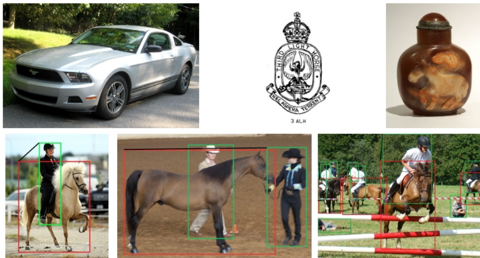
Figure 1: The upper row shows: A Ford Mustang, the 3rd Light Horse Regiment hat badge, and a snuff bottle. The lower row shows: A human riding a horse, one human leading the horse and one bystander, and seven riders and two bystanders. Bounding boxes are displayed.

solver (Stamborg et al., 2012) to parse the Wikipedia articles. For each word, the parser outputs its lemma and part of speech (POS). In addition, the parser produces a dependency graph with labeled edges for each sentence as well as the predicates it contains and their arguments. For each article, we also identify the words or phrases that refer to a same entity i.e. words or phrases that are coreferent.