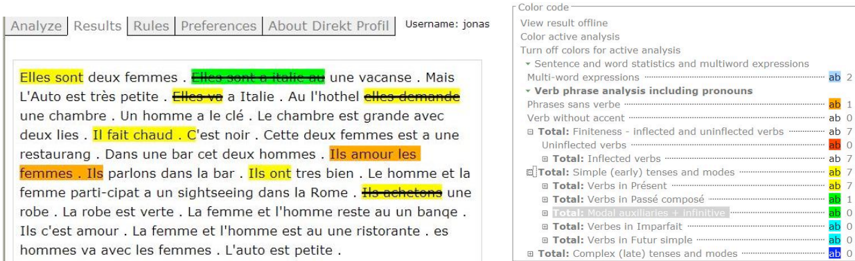
Figure 2: The graphical user interface.