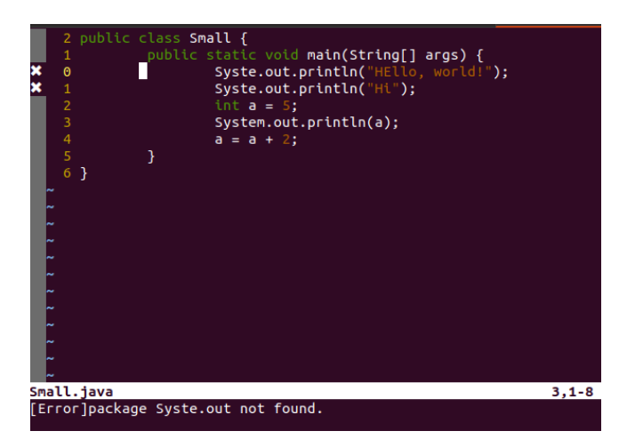
Figure 3. An example of the diagnostics message being displayed in vim.