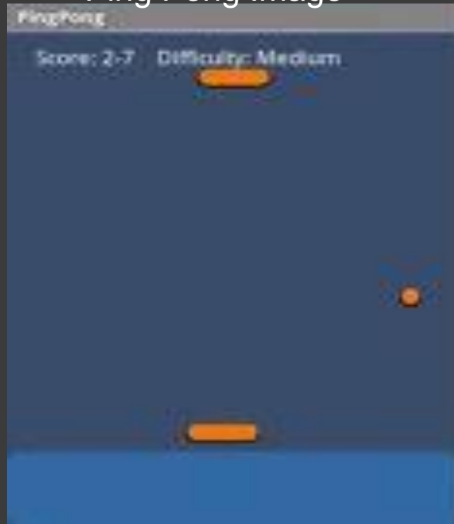
Ping Pong Image